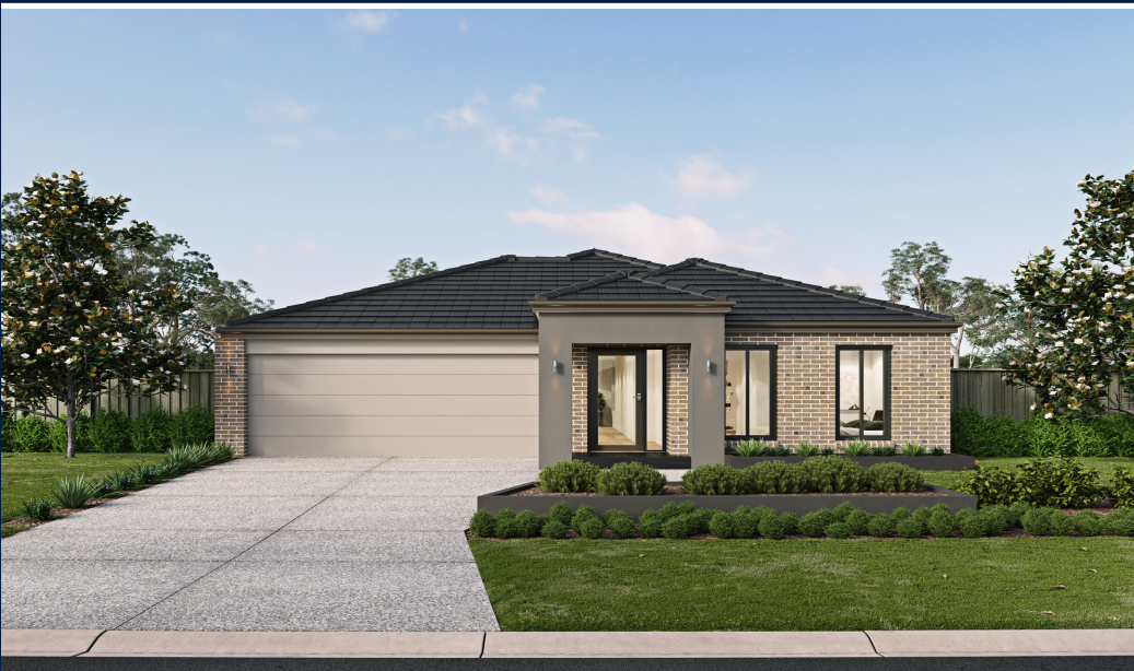
Price excludes: Fencing, Landscaping, Concrete pavers, Planter boxes, Decking