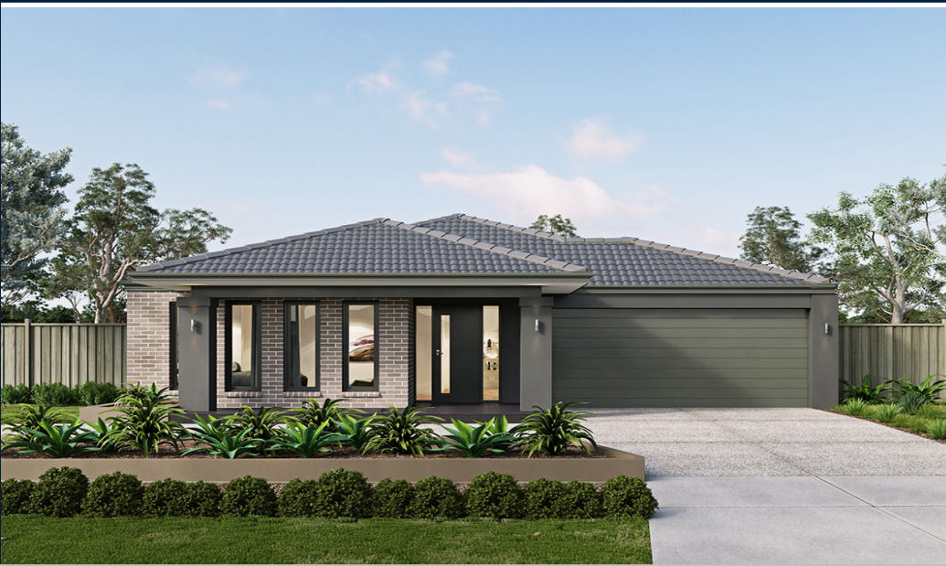
Price excludes: Fencing, Landscaping, Concrete pavers, Planter boxes, Decking